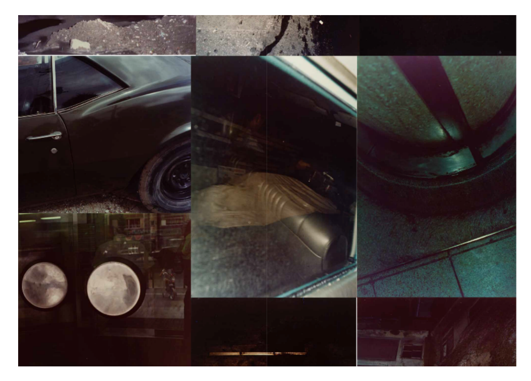
Takuma Nakahira © Gen Nakahira Courtesy of Osiris

Takuma Nakahira's series 'Overflow' was originally presented as an installation during the 1974 exhibition 'Fifteen Photographers Today' (National Museum of Modern Art, Tokyo). The work consisted of 48 color photographs that were arranged on a wall 6 meters wide and 1.6 meters high. The photobook 'Overflow' is the first chance to view Nakahira's astonishing series outside the context of an exhibition.