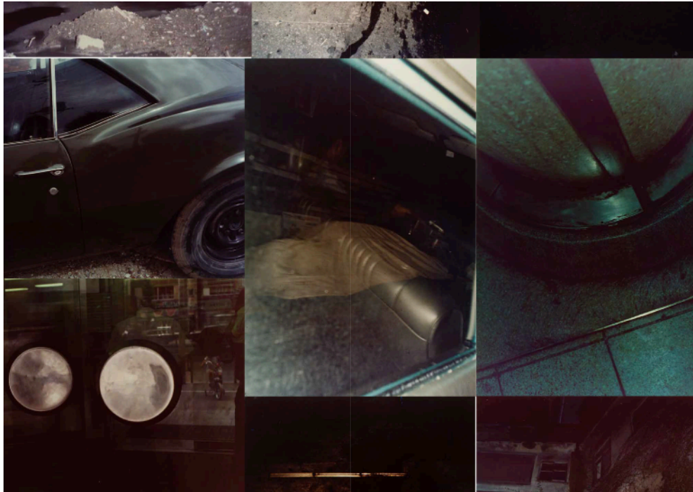
Takuma Nakahira

Takuma Nakahira’s series ‘Overflow’ was originally presented as an installation during the 1974 exhibition ‘Fifteen Photographers Today’ (National Museum of Modern Art, Tokyo). The work consisted of 48 color photographs that were arranged on a wall 6 meters wide and 1.6 meters high. The photobook ‘Overflow’ is the first chance to view Nakahira’s astonishing series outside the context of an exhibition.